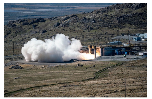
Static fire test of the first stage of the newly developed 34.5" common hypersonic missile