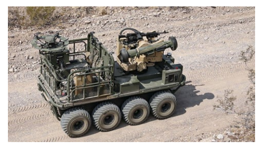
"Small Multipurpose Equipment Transport (S-MET) maneuvers through desert terrain."