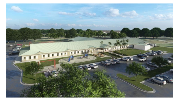
Rendering, FY21 Child Development Center, Schofield Barracks, HI

BRAC funds support environmental remediation actions at sites closed during prior BRAC rounds