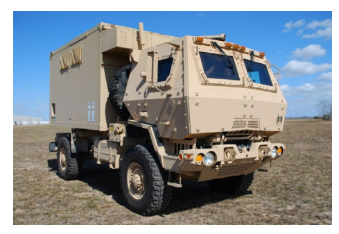
Medium Tactical Vehicles customized with controls that allow engines to turn on and off automatically according to power requirements.

The Army's most enduring advantage is our highly qualified and capable talent – the cornerstone of America's Army