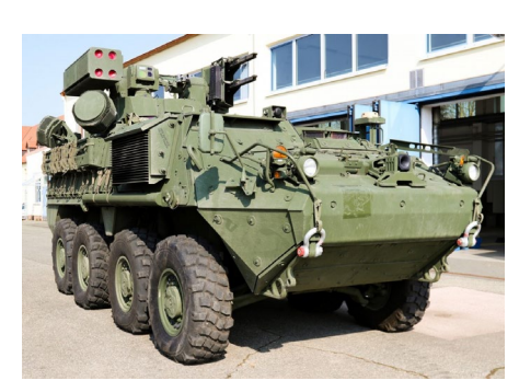
M-SHORAD system bolsters Army's air defense capabilities

The Army is investing in advanced capabilities that enable integrated deterrence across all warfighting domains