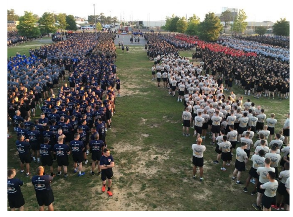
Paratroopers prepare for a 4 mile Division Run