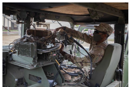
Soldier conducts start-up procedures on a Joint Battle Command-Platform (JBC-P)