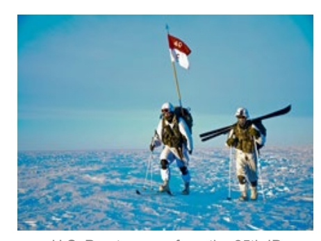
U.S. Paratroopers from the 25th ID Spartan Brigade conduct operations north of the Arctic Circle

The Army provides ready, combat-credible forces to the Joint Force to support enduring campaigns and active response missions