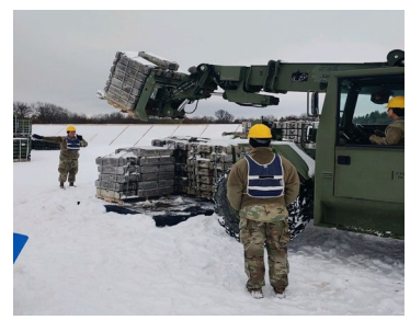
Army Reserve instructors carried out the Ammunition Specialist Course at Fort McCoy, Wis.