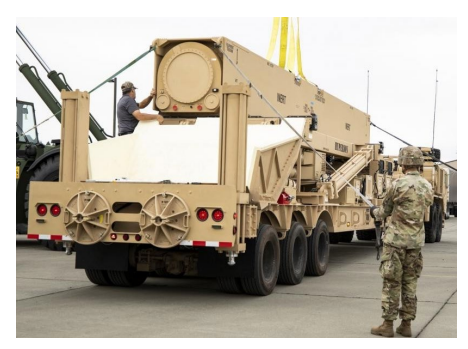
Delivery of hypersonic hardware