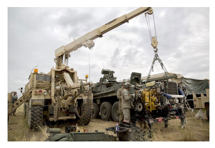
Army Soldiers conduct pass-back maintenance in decisive operations