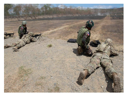
The Philippine Army train U.S. Soldiers on Philippine weapon systems during Exercise Salaknib