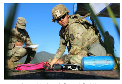
Army National Guard Soldier competes in the Best Warrior Competition in Wahiawa, HI