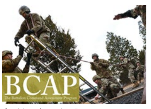
Candidates from cohort 5 attempt to traverse an obstacle at the Leader Reaction Course during BCAP