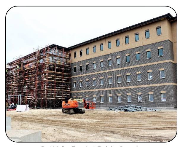
Fort McCoy Transient Training Barracks construction project

BRAC funds support environmental remediation actions at sites closed during prior BRAC rounds