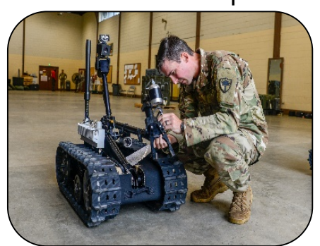
A combat engineer tests the capabilities of the Talon IV

Provide sustainable, Soldier-ready systems, in sufficient quantity to overmatch potential adversaries with speed, range, connectivity and adaptability in multiple operational environments