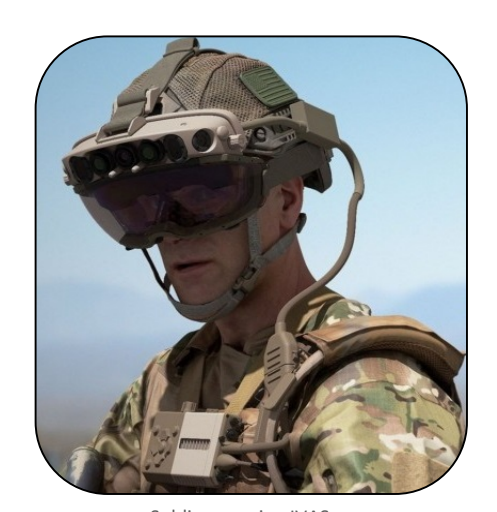
Soldier wearing IVAS