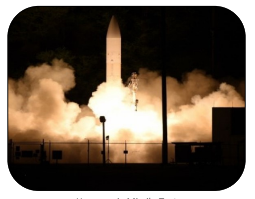
Hypersonic Missile Test