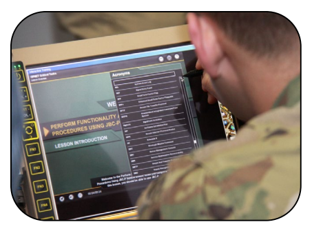
Soldier using a Joint Battle Command-Platform System