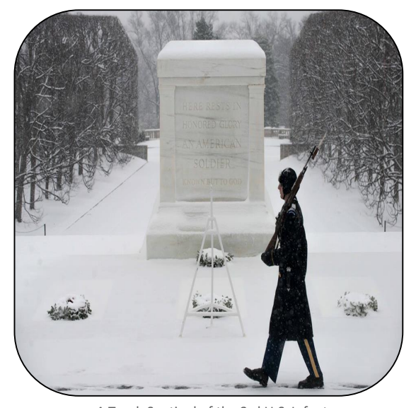
A Tomb Sentinel of the 3rd U.S. Infantry Regiment (The Old Guard) braves winter conditions while on his post.