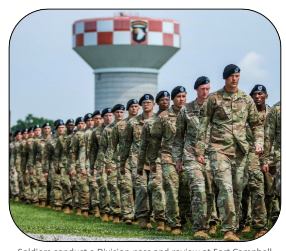
Soldiers conduct a Division pass and review at Fort Campbell