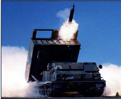
M270A1 Launcher with GMLRS Rocket