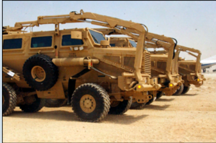
Buffalo Mine Protected Clearance Vehicle