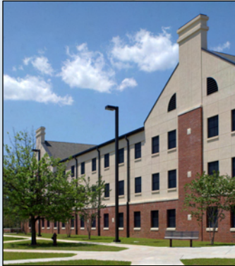
Barracks at Fort Bragg, N.C.