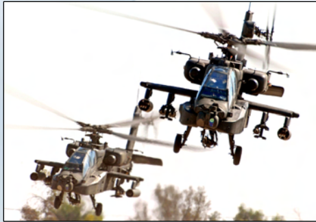
AH-64, Attack Helicopter